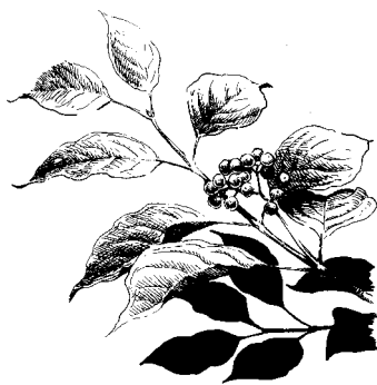
Dogwood branch with fruit

Bluebirds are attracted to shallow water for bathing. They prefer water that is less than 2 inches deep. Place flat rocks at varying water depths to provide secure footing and allow bluebirds to select the depths that they prefer. Bluebirds also are attracted to dripping water. Commercial drippers are available, but a garden hose hung over a bird bath also will work. Bluebirds are more likely to use water that has perches nearby. Locate water sources near existing perches, or plant shrubs and trees near the water source.