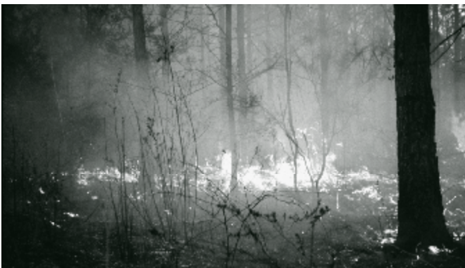
Figure 1 and 2: Prescribed fire and regular timber thinnings are two of the most important management tools that land managers have to manipulate native vegetation to benefit white-tailed deer.

The forest habitat type is a second factor to consider when deciding how to establish food plots for white-tailed deer. Various forest habitats and the soils upon which they exist play an important part in determining the carrying capacity of deer and other wildlife on an area. Pine and mixed pine/hardwood forests of Louisiana cannot support the numbers of deer that our state's bottomland hardwood forests are capable of supporting. Regardless of the forest type, regular manipulation of the native habitat by timber management is necessary to keep a forest productive for deer. Clear-cutting, regular thinning and prescribed burning are forest management activities that land managers can use to accomplish this task. With the forest habitat type considered, food plots have the potential to be more beneficial where soil and timber types are not as productive in providing the necessary food and cover for white-tailed deer.