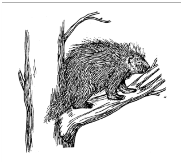
Figure 1. Porcupines are Alberta's second largest rodent

The porcupine is Alberta's second largest rodent, measuring up to 90 cm in length and weighing as much as 12 kg (Figure 1). They live throughout the province, usually near stands of woody vegetation. The porcupine has a unique defence mechanism of up to 30,000 hardened barbed quills built into its coat.